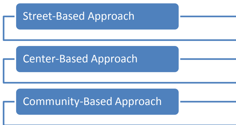
Figure 2: Based on Demartoto (2012), Classification of Street Children Programs