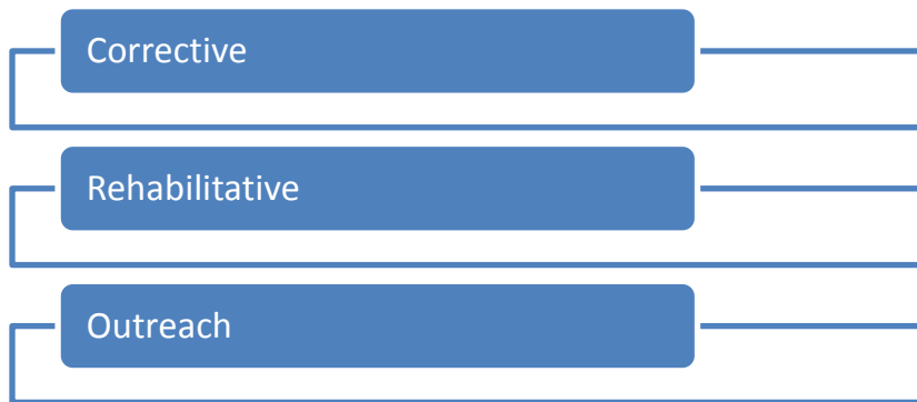
Figure 1: Based on Harris et al (2011), Classification of Street Children Programs

or outreach teams to engage with the children on the streets, to get to know them and start building a relationship of trust with them then includes the reception center for the daily visits of children. The mobile unit, outreach activities and the reception center are considered the early detection phase. The next service is the temporary shelter and finally the permanent shelter. Shelters are focused more on providing rehabilitative services such as different workshops for children to express their views and to learn income-generating activities that can support them in their future. Each of the interviewed local NGOs has four out of the five steps of this model. The model combines the three approaches highlighted by Demartoto (2012); the street-based approach, the center-based approach and the community-based approach. The model also matches with the rehabilitative and outreach approaches identified by Harris et al (2011).